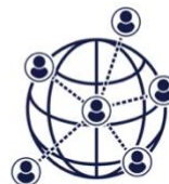
Solution & Service Providers