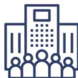
Government & Commercial